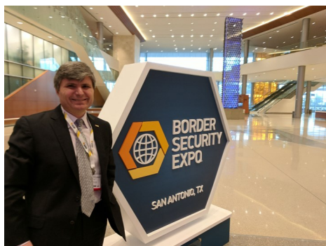
Border Security Expo 18