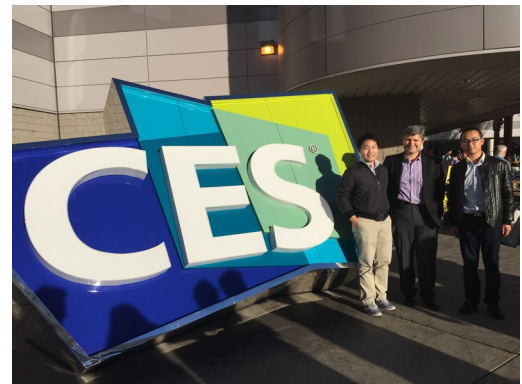
Consumer Electronics Show 18