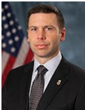
Acting Commissioner Kevin McAleenan, CBP