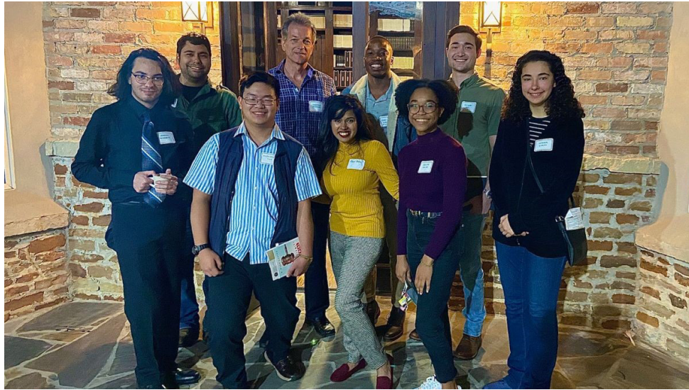
Religious Studies Majors and Minors at the Lanier Theological Library (photo taken February 8, 2020)

Last semester launched with a successful gathering of students and faculty at the Religious Studies annual luncheon. In addition to this traditional meeting, new student engagement efforts helped foster a stronger culture among our passionate community of Religious Studies students and faculty.